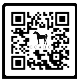
Rules for Conduct of Shows

Only ECAHO approved QR codes are allowed as they guarantee the latest version of the regulations and usage statistics. These QR codes can be downloaded from the ECAHO website.