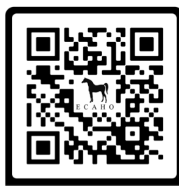
Rules for Sportclasses