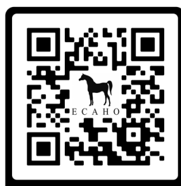
Rules for Conduct of Shows

Only ECAHO approved QR codes are allowed as they guarantee the latest version of the regulations and usage statistics. These QR codes can be downloaded from the ECAHO website.